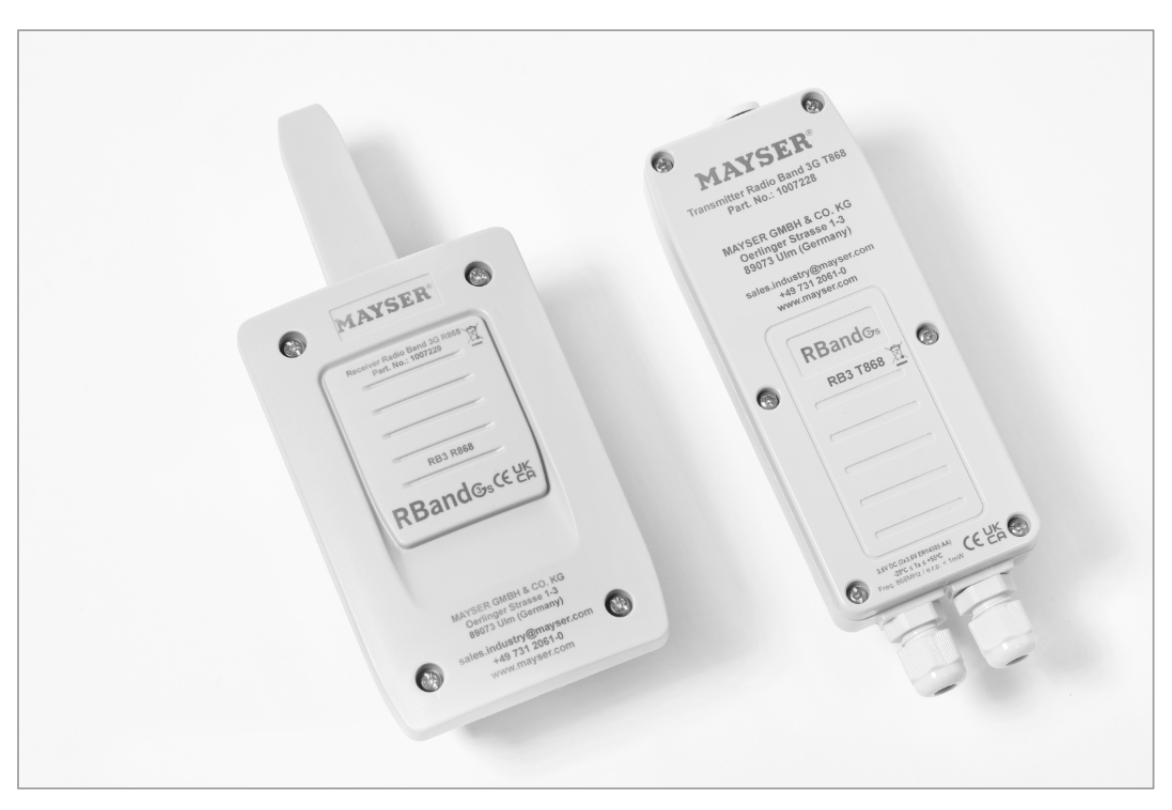
Universal radio transmission system as an ideal complement to Mayser sensor profiles SP